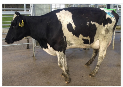
Typical stance of a humeral fracture – totally non-weight bearing in front left (note the healthy looking dark coat)

Biopsy vs. blood test: Numerous studies have suggested that liver biopsies are a more accurate way of assessing copper stores than blood samples. Blood samples are quick and easy, and useful to give an average approximation, but liver biopsy gives a more reliable result. Biopsies on 5-6 cows can be done in a race, or via the abattoir.